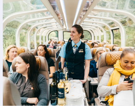
Complimentary Wine & Cheese