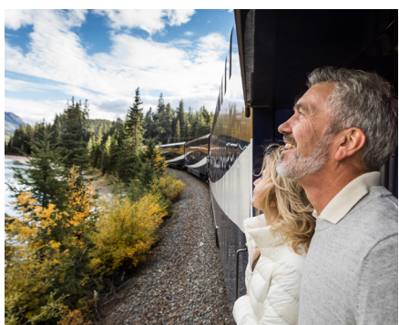
Exclusive Outdoor Viewing Platform